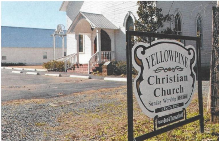
Yellow Pine Christian Church's new Sunday school building was built to replicate the sanctuary in the foreground.